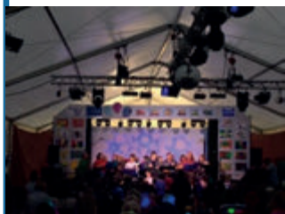
Hilton's Got Talent Night

Check out www.hiltonfeastweek.btck.co.uk/200club for full details.