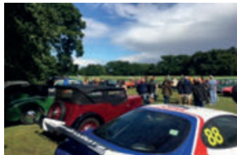
Classic Vehicle Show & Weather

Hilton Feast Week committee would like to say a massive Thank You to everyone who was involved in another successful week. Whether it was our fantastic volunteers (we won't even attempt to name them all, but you know who you are) to those who came along to support the various events come rain or shine, without you all it wouldn't have been the fun that it was.