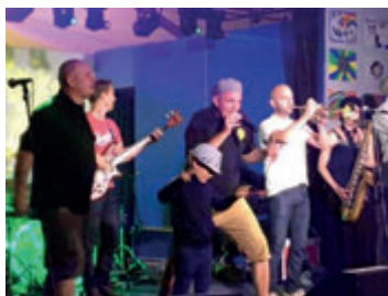
Big Ten Comeback with Special Guest

Nights, oh and who can forget Hilton's Got Talent. The introduction of the Hilton 200 Club has started off well, and there is still plenty of time to join up for the future monthly draws.