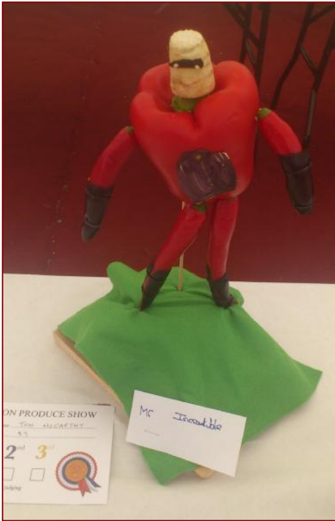
A VEGETABLE SUPER HERO (Hilton Produce Show)