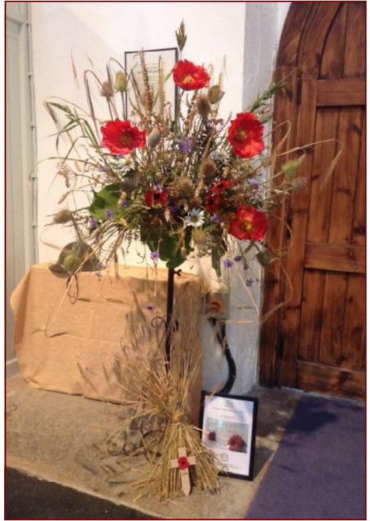
WW1 HILTON REFLECTS AUGUST 1ST - 4TH

One copy delivered free to each household ten times per year.