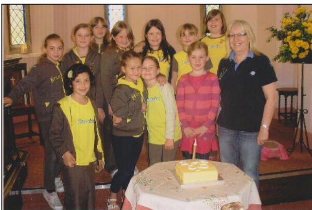
the Girls with the Division Commissioner