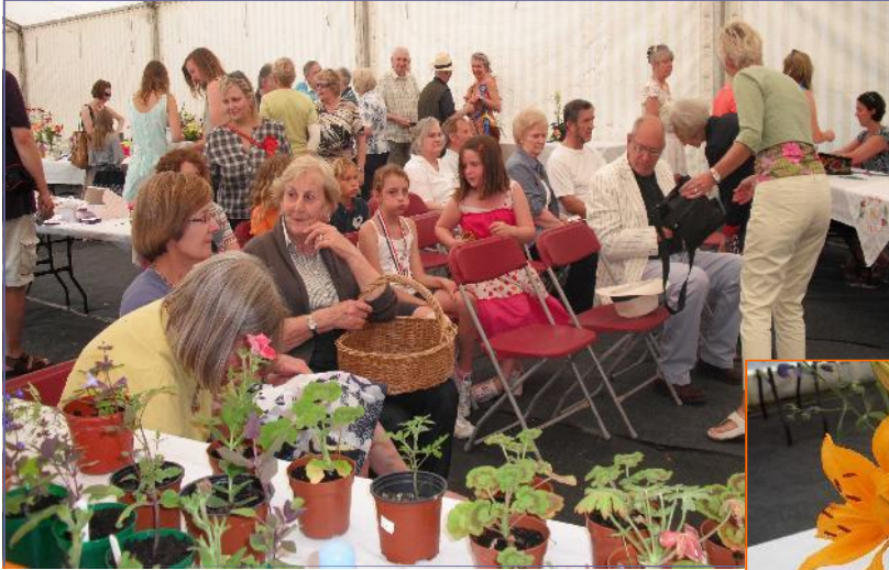
WAITING FOR THE RESULTS