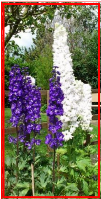
SPECTACULAR BLUE & WHITE DELPHINIUMS IN ONE OF FENSTANTON OPEN GARDENS