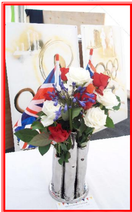
PATRIOTIC FLOWERS AT HILTON PRODUCE

One copy delivered free to each household ten times per year. Available online at