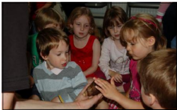
Some of the children meeting the ‘creepy crawlies

Last term we hired the hall in Hilton and met the “mini-beasts”. The children (and their mums) had the opportunity to make friends with Rosie the tarantula and her friends including Brian the snail, George the frog, Elvis the scorpion and Jarvis the cockroach when we met the “mini beasts”.