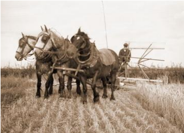
Harvesting in Hilton circa 1930

One copy delivered free to each household ten times per year.