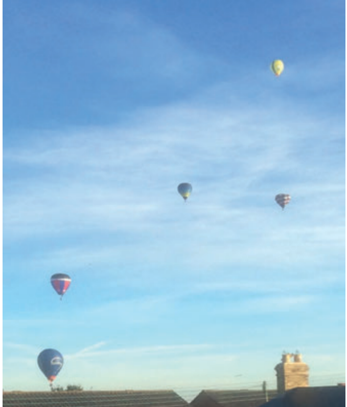
Hot air balloons over Fenstanton on 23rd August, see P7

One copy delivered free to each household ten times per year. Available online at: