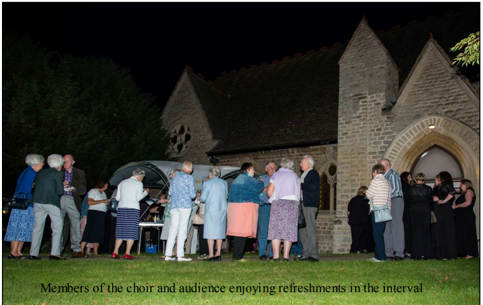
Members of the choir and audience enjoying refreshments in the interval

Both pictures © 2015 Stephen Radley; steve@radley.photography