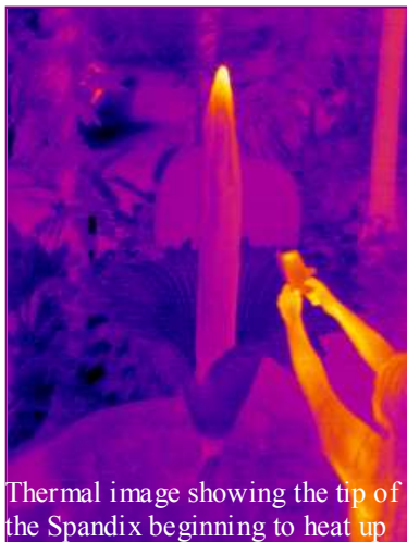
Thermal image showing the tip of the Spadix beginning to heat up

Earlier this summer thousands came to witness the dramatic flowering of one of the Garden's rarities, a titan arum from the rainforests of Sumatra. Also known as the corpse flower for the stink of rotting meat it emits in flower, the titan arum produces one of the largest single flowering structures in the world – ours reached 130cm and this was tiny compared to others! The dramatic structure is not actually a flower at all, but an inflorescence, comprising a central, spike-like spadix, surrounded by a frilly, funnel-shaped spathe. At its base, the spathe, really a highly modified leaf, forms a protective chamber enclosing thousands of actual flowers. These are arranged in rings; the lower rings of female flowers open on the first night of full flowering and the upper rings of male flowers open on the second night.