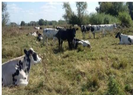
Cattle on Ferry Mere - Simon Freedman

Visitors to Fen Drayton Lakes between spring and autumn will likely have seen at least one of the cattle herds grazing around some of the reserve lakes. This grazing is one of the most important tools at our disposal for managing our wetland habitats and mimics the actions of large, native herbivores that would once have been common.