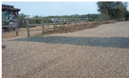
New surface and pedestrian crossing

Why not come down one day this winter to make use of the improvements and then go for a walk around one of the lakes? At the time of writing the vanguard of wintering species has started arriving, so it is only a matter of time before they arrive en masse. It won't be long before large flocks of wintering thrushes, such as redwing and fieldfare, from northern Europe will be visiting the hawthorn scrub along the access road and around the lakes. Wigeon, a grazing species of duck with a tell-tale whistling call, will be around the lakes and large numbers of waders, particularly lapwing, will be moving around the muddy lake edges and surrounding fields. There will always be something to see.