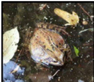
This is one of the frogs they found.

It was an amazing effort and goes to show how much can be done with teamwork. It looks fantastic and will benefit the children as they now have an exciting outside learning environment.