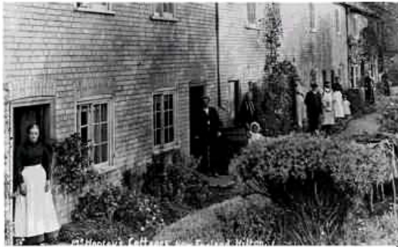
Mr Hooley's Cottages, New England date unknown