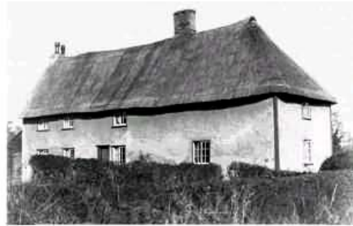
Tithe Cottages 1938, demolished 1979