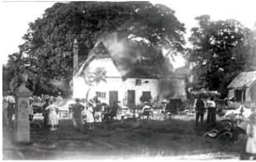
The Old Vicarage, burning in 1928