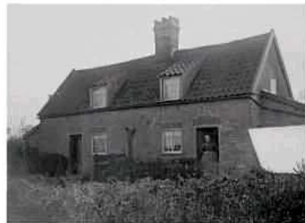
Two cottages Church End date unknown

Can you find anything else? If your photos are precious, we can scan them at your home, or take away and