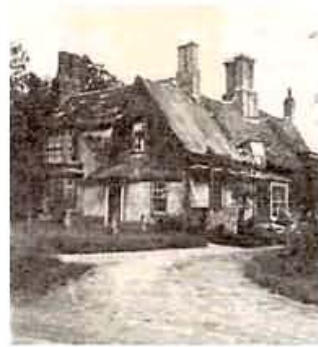
Old Park Farm 1939 demolished 1945