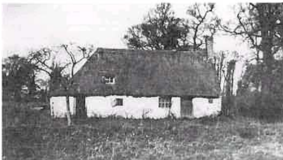
Cottage, next to Rose Cottage collapsed in 1943