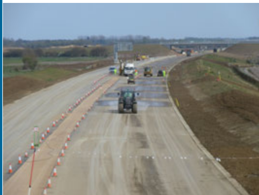
East towards Fenstanton