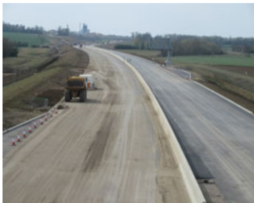
West towards Godmanchester