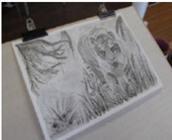
A Work in progress