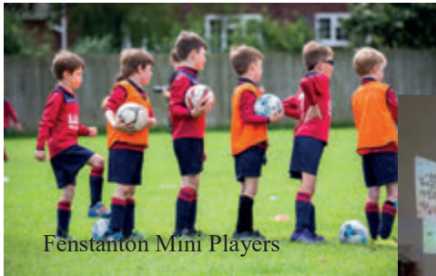
Fenstanton Mini Players