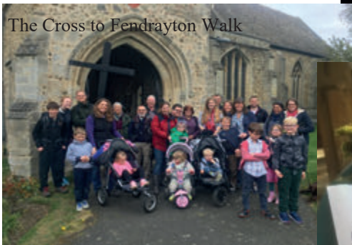
The Cross to Fendrayton Walk