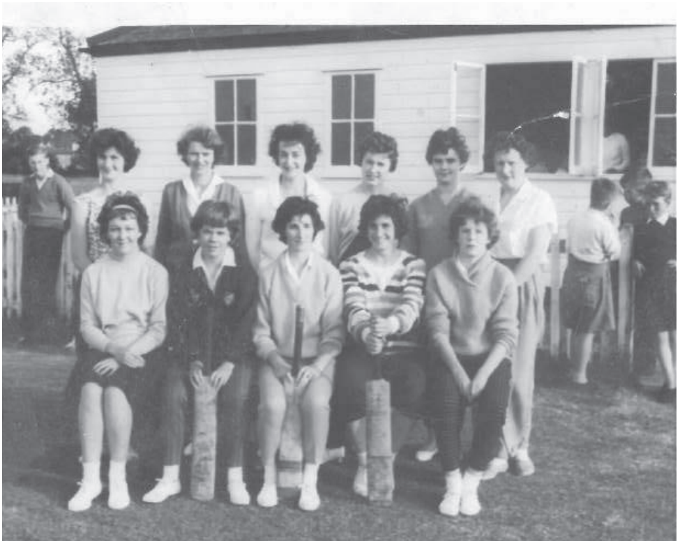
Fenstanton Ladies Cricket Team, taken on the Cricket Field, by the pavilion in 1963

We had two very successful seasons, and a lot of fun.