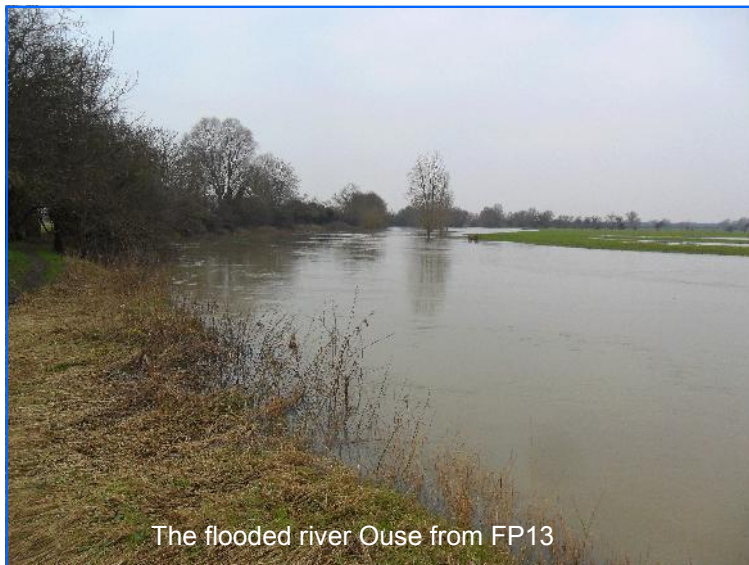
The flooded river Ouse from FP13

Fenstanton parish has a network of public and permissive footpaths which is maintained by the Parish Council with occasional grant assistance from Cambridgeshire County Council (CCC). There is an excellent leaflet which includes a map and descriptions of the parish footpaths. If you would like a copy, please contact me with your name