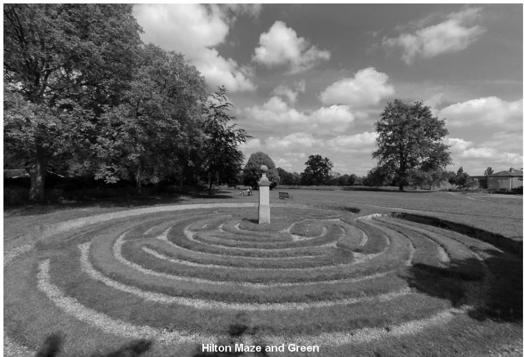
Hilton Maze and Green