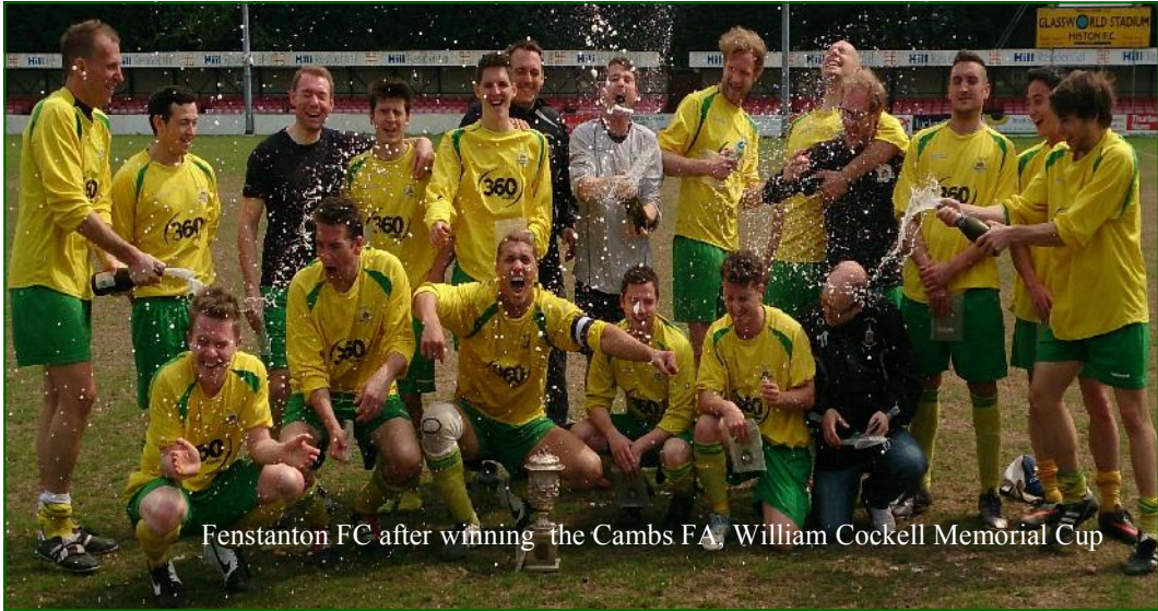
Fenstanton FC after winning the Cambs FA, William Cockell Memorial Cup

The football season has finally come to an end but not without ending on a high note!