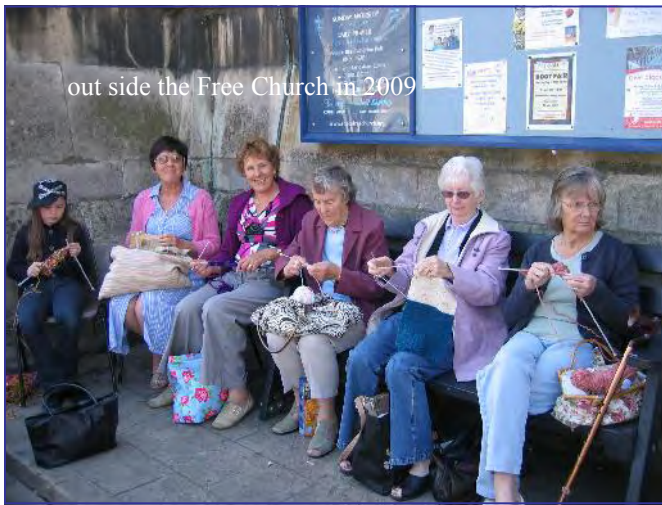
out side the Free Church in 2009