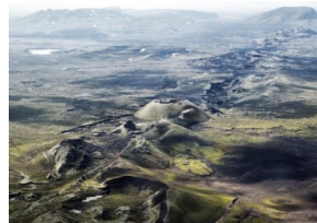
The site of the giant fissure in 2018

On the 8 June 1783 a giant fissure appeared in the ground in Laki in Iceland. The eruption that followed lasted eight months and threw 8 million tons of hydrogen fluoride into the atmosphere. The resulting toxic cloud that spread over Europe was known as the Laki Haze, reaching Britain on the 23 June 1783. The following summer (1784) became known as the 'Sand Summer' due to the ash fallout.