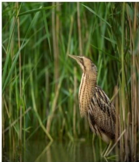
Eurasian bittern, Botaurus stellaris, standing in reedbed habitat

Over on Elney Lake we have also removed spindly willows from one of the islands to open up new reedbed. You may notice the eastern half of the lake is quite open now.