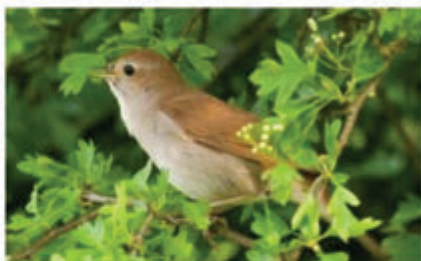
Nightingale

the BTO and advice from other sites. It will take a while for us to see the fruits of our labour, but we are hopeful that nightingales will continue to sing at Fen Drayton Lakes for many years to come.