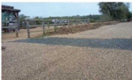
New surface and pedestrian crossing - Simon Freedman

Why not come down one day this winter to make use of the improvements and then go for a walk around one of the lakes? At the time of writing the vanguard of wintering species has started arriving, so it is only a matter of time before they arrive en masse. It won't be long before large flocks of wintering thrushes, such as redwing and fieldfare, from northern Europe will be visiting the hawthorn scrub along the access road and around the lakes. Wigeon, a grazing species of duck with a tell-tale whistling call, will be around the lakes and large numbers of waders, particularly lapwing, will be moving around the muddy lake edges and surrounding fields. There will always be something to see.