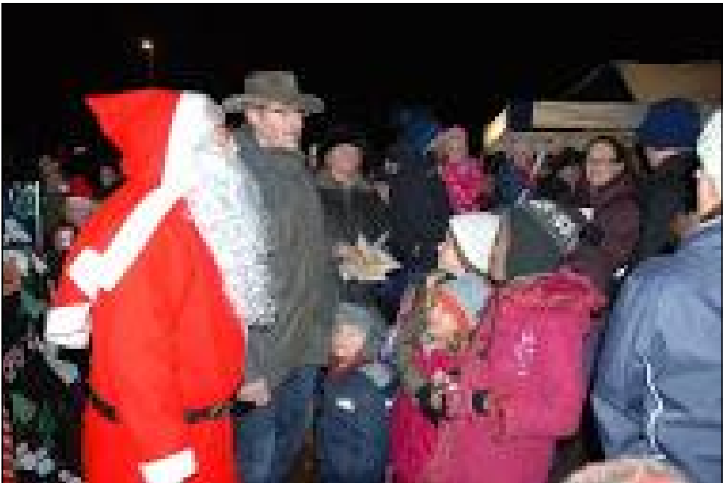
Some of the supporters on a very nasty evening!