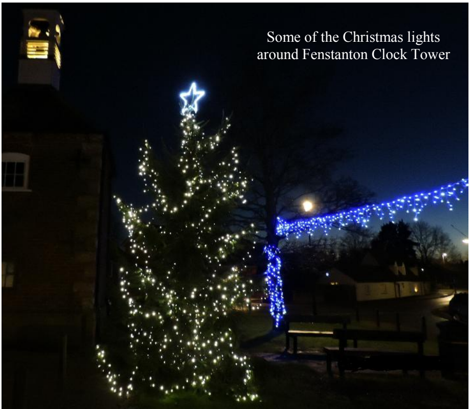
Some of the Christmas lights around Fenstanton Clock Tower