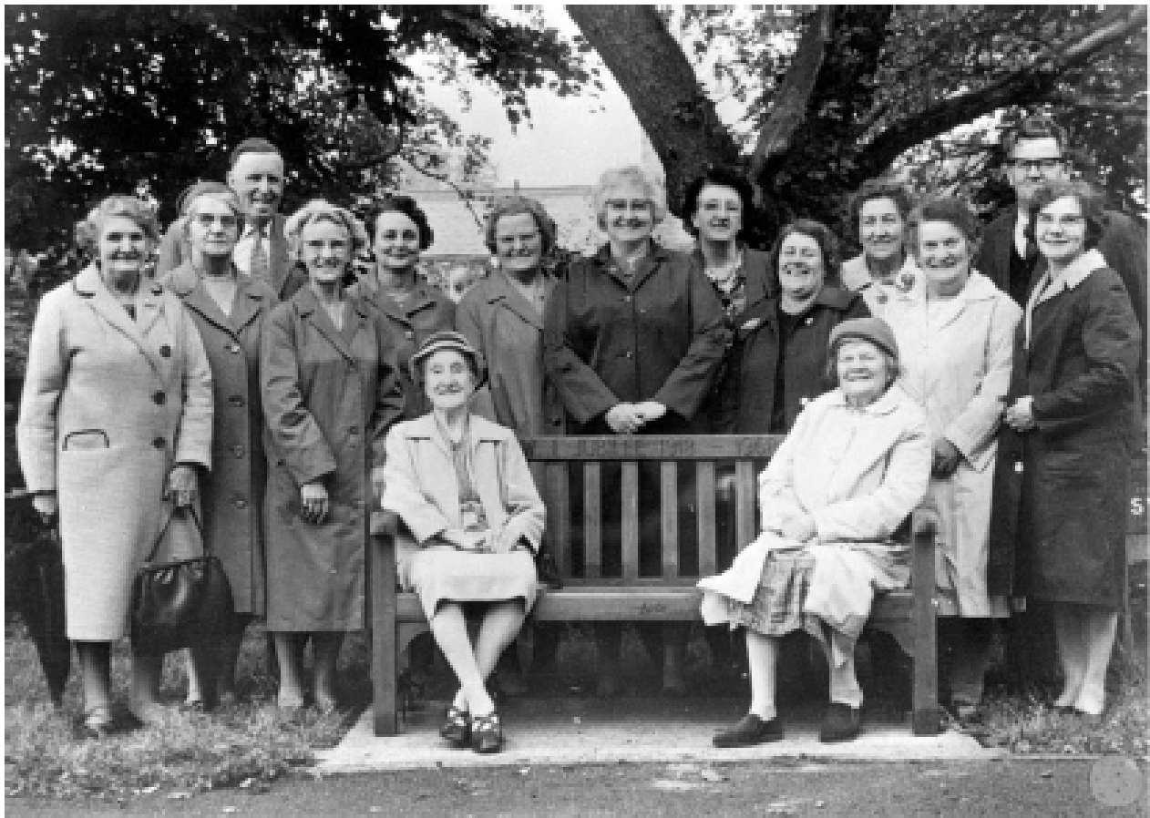
37. Cherry Tree Way - Women's Institute Seat 1968